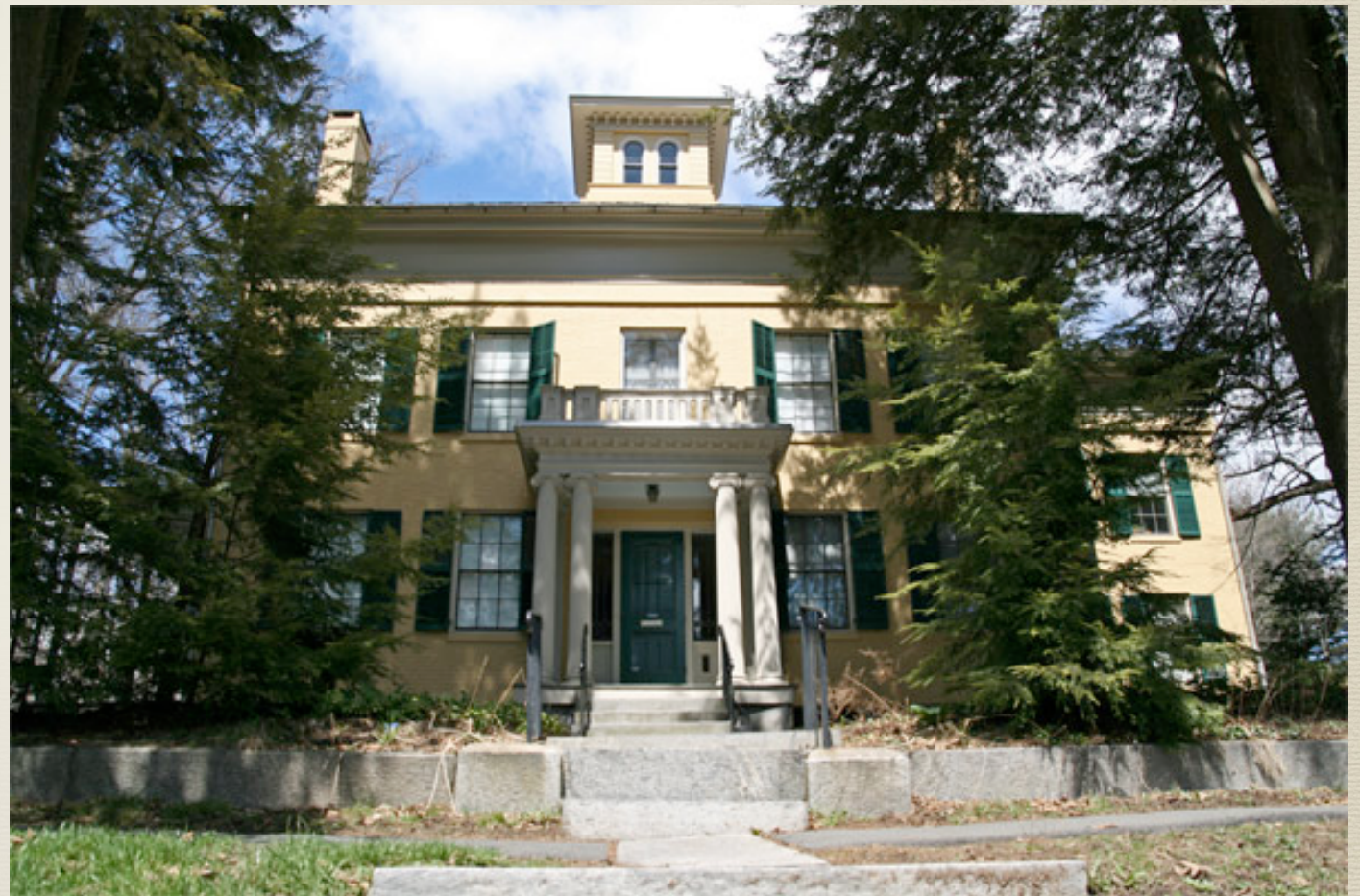
The Homestead in Amherst, MA